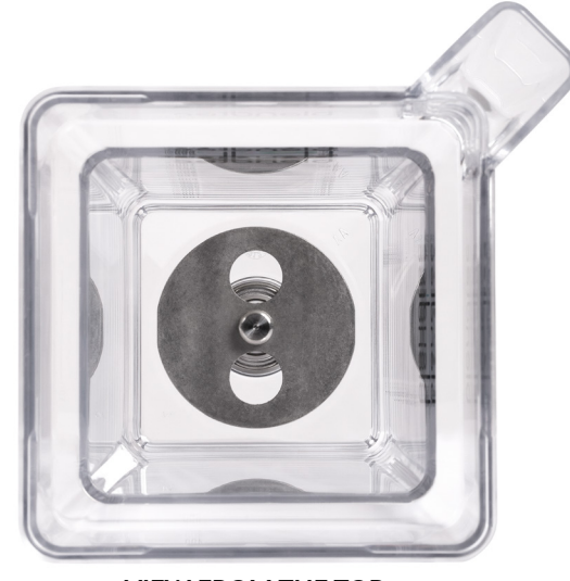
VIEW FROM THE TOP Blendtec's innovative frothing blade